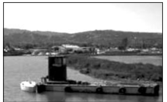
Photos: Upper left corner a Granite Rock crane operator on the levee pulls the remains of derelict vessels from the water for disposal; upper right corner a sailboat sunk in Redwood Creek which was later crushed by SimsMetals and disposed of by Granite Rock; smaller photo above is a picture of a barge owned by Ferma Corporation temporarily anchored in the Creek to which several abandoned sailboats had been moored; photo to the left is an abandoned cabin cruiser.